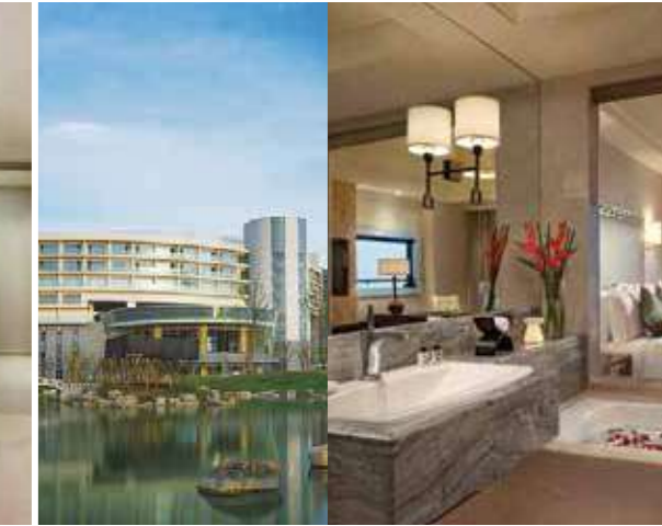
Fairmont Yangcheng Lake, China