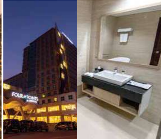
Four Points by Sheraton Indonesia