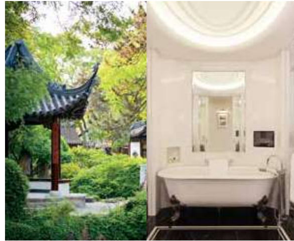
Fairmont Peace Hotel Shanghai, China