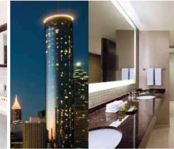
The Westin Peachtree Plaza Atlanta Georgia, USA