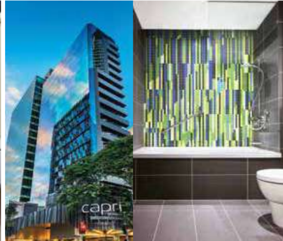
Capri Hotel Residences Brisbane, Australia