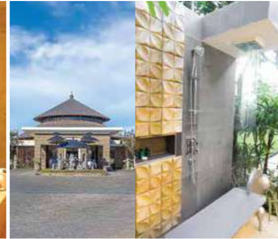
Sofitel Villas Nusa Dua, Bali, Indonesia