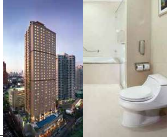
Marriott Executive Apartments Bangkok, Thailand