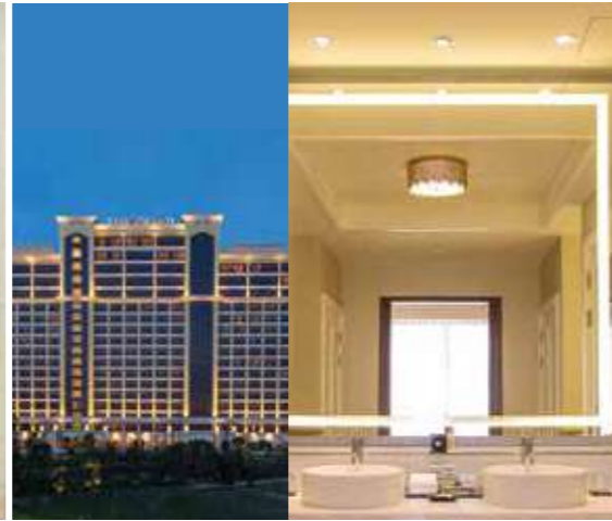
The Grand Ho Tram Strip Hotel Ba Ria-Vung, Vietnam