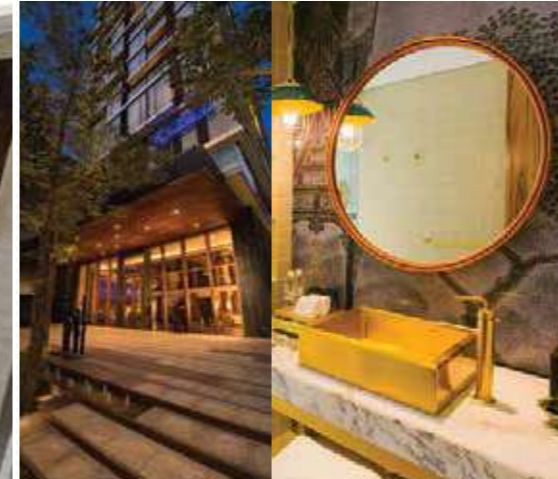
Hotel Indigo Bangkok, Thailand