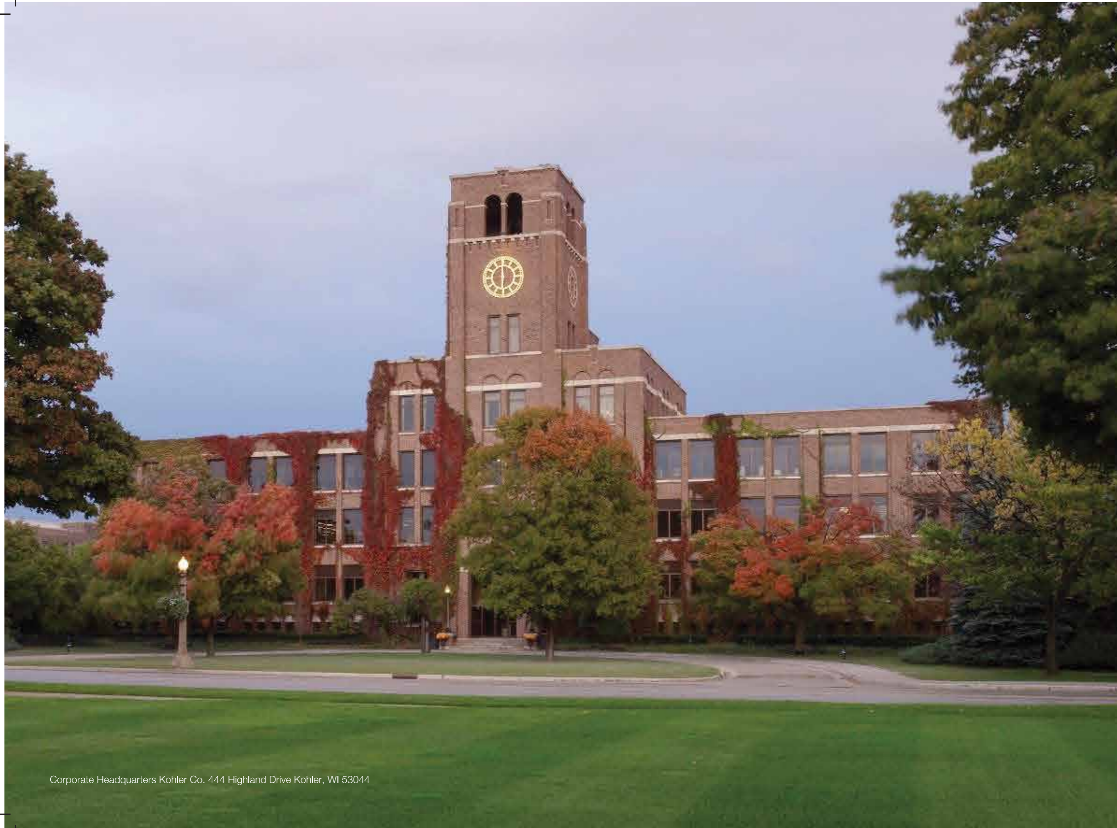
Corporate Headquarters Kohler Co. 444 Highland Drive Kohler, WI 53044