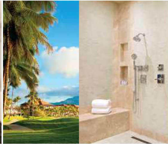
The St. Regis Bahia Beach Resort Puerto Rico