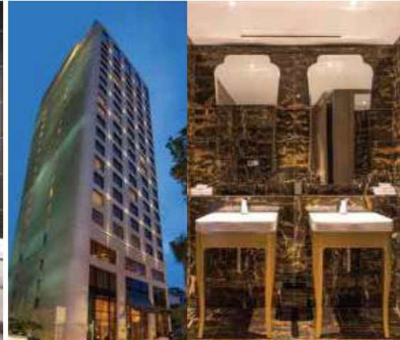
Hotel Des Arts Ho Chi Minh City, Vietnam