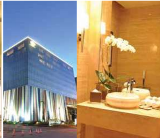
Crown Towers Manila, Philippines