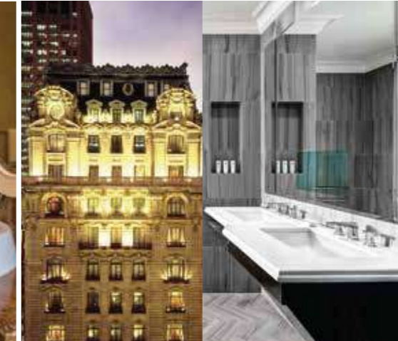
St. Regis New York, USA