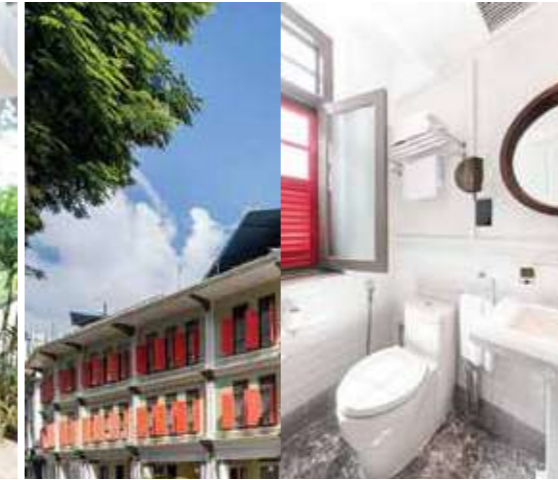
The Club Hotel Singapore