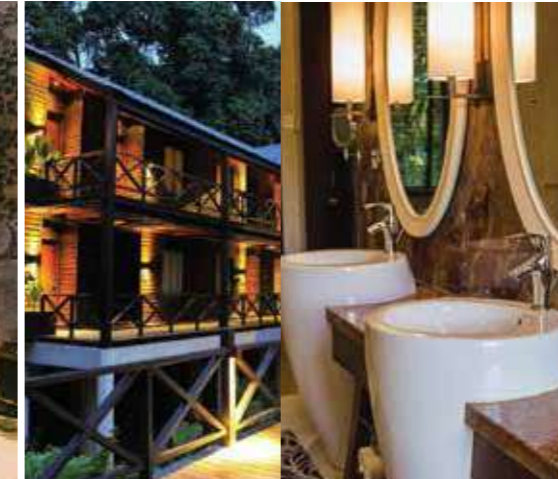
Mulu Marriott Resort & Spa Mulu, Malaysia