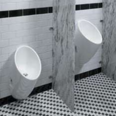
Steward<sub>o</sub> S Waterless urinal K-4917-0

Cimarron<sub>®</sub> Comfort Height<sub>®</sub> elongated 1.6 gpf toilet and Brevia<sub>w</sub> toilet seat K-3589-0 / K-4664-0