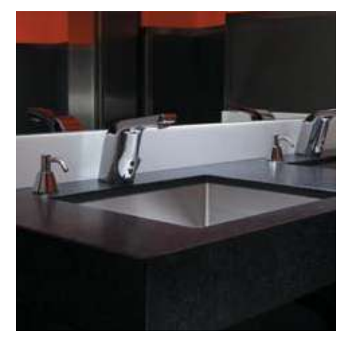
Insight... Sculpted Touchless lavatory faucet with Insight... technology K-13460-CP