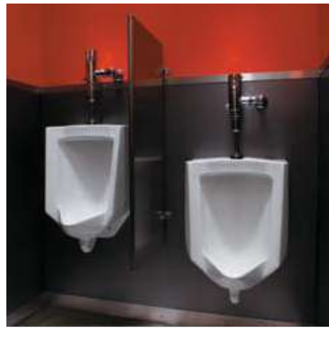
Bardon <sub>**</sub> 1% gpf urinal with top spud K-4904-ET-0

Kingston... 1.28 gpf toilet with top spud and Stronghold... elongated toilet seat with check hinge K-4325-0 / K-4731-C-0